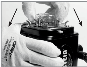
removing the flashtube