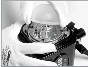
removing the frosted dome