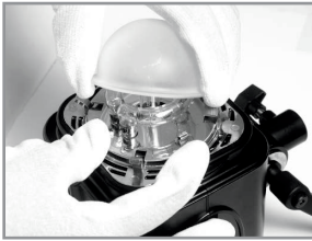
bending the spring clips