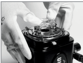
installing the new flashtube

When replacing the flashtube and/or modeling lamp, always turn your flash unit OFF and unplug the power cord from the AC power source. Wait at least five minutes for the unit to cool and to ensure that it does not have any power stored in the capacitors before handling it.